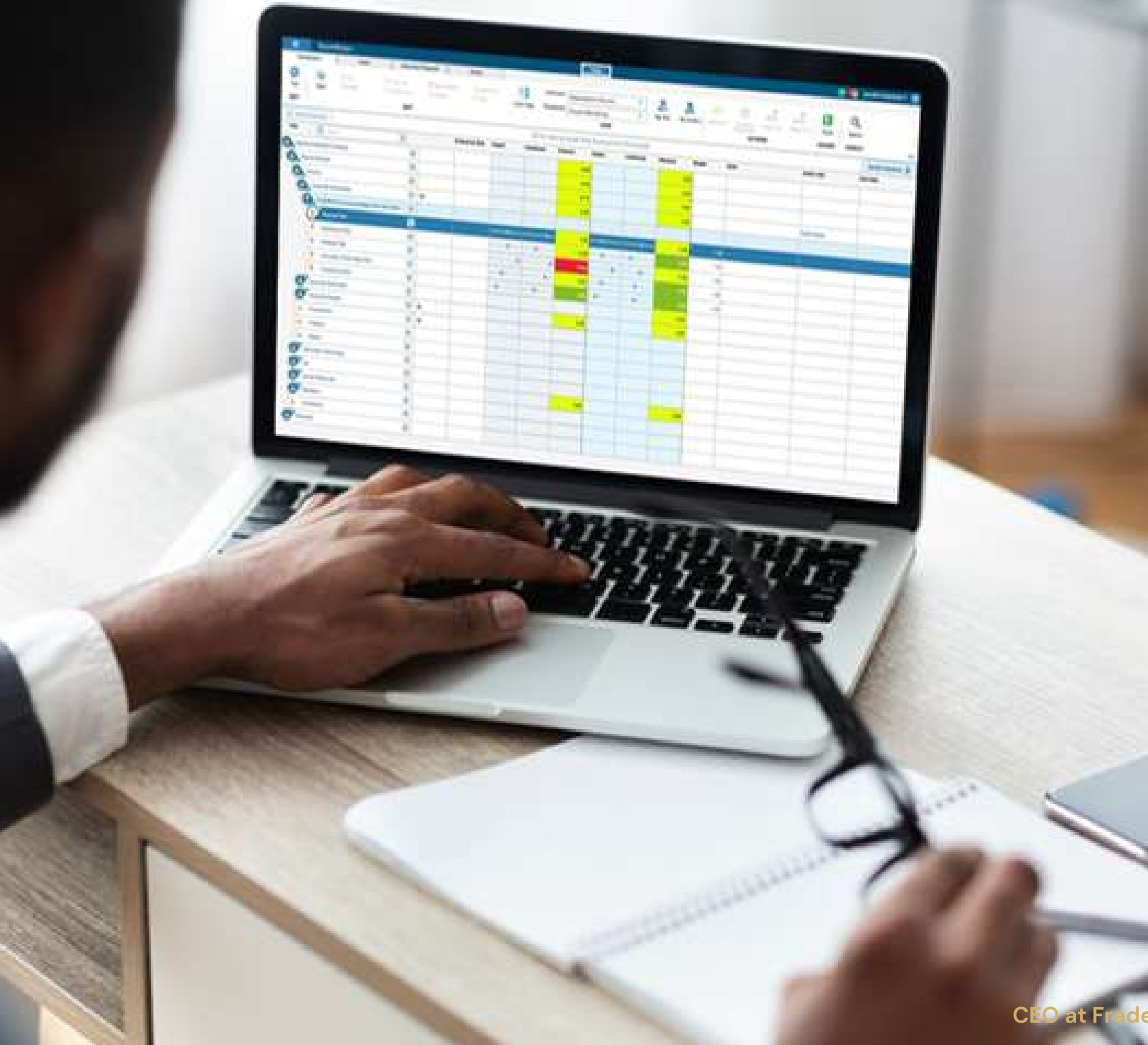
CEO at Fradel and Spies